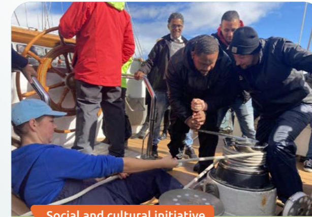
Social and cultural initiative

Sailing Ship Eendracht Foundation Sailing with people from a protected living programme