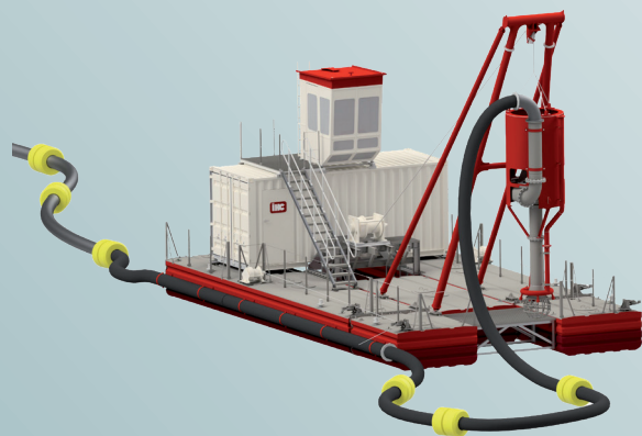
Vertical deployment type – for dredging loosely compacted soil

Is used for dredging loosely compacted soil. In this vertical deployment configuration, the OTTer®-Pump is fitted with a sand production head and jetting water nozzles and is suspended from an A-frame and lowered under gravity to the dredge surface up to 50m deep.