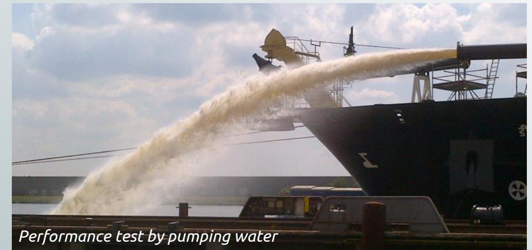
Performance test by pumping water