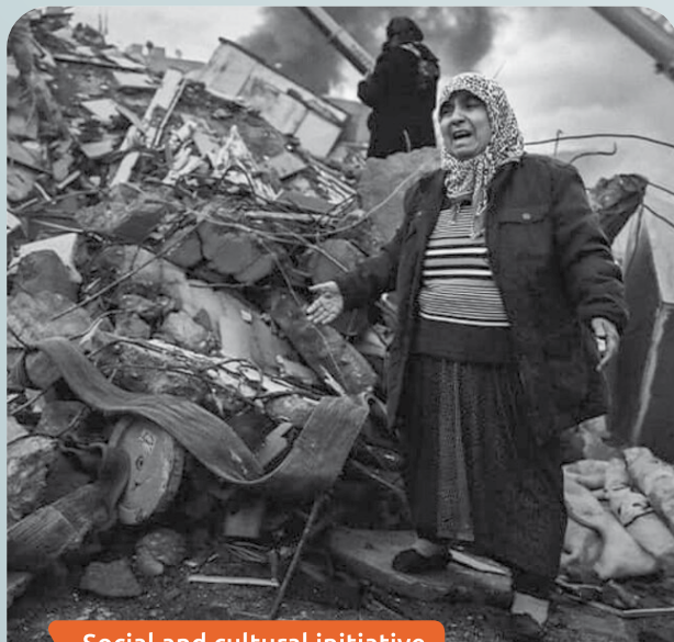
Social and cultural initiative

With the involvement of its employees, the IHC Foundation supports social and cultural initiatives in the regions where Royal IHC is active. In 2023 a total of €8,500 was donated to these initiatives. Some of the IHC Foundation's key social and cultural initiatives are highlighted below.